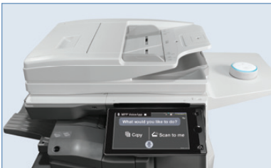
MX-6071 shown with available Sharp MFP Voice feature with Alexa.