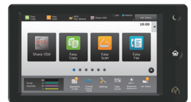
Award-winning 10.1" (diagonally measured) customizable touchscreen display.