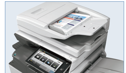
Sharp's ImagesSEND™ feature provides one-touch distribution to email, cloud applications and more.